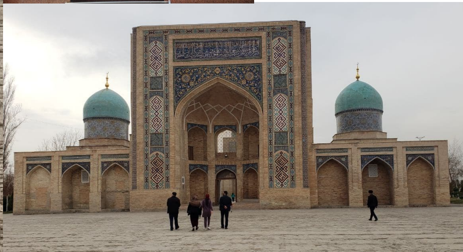
Mosque in Tashkent

Our quarantine group consisted of Fulbright Grantees and English Speaking Nation Coaches. Together, with decades of combined experience living abroad, we gained new perspectives, strong relationships, and assorted new vocabulary from over 10 languages! We will all be living and working in the Ferghana Valley of Eastern Uzbekistan. This week we will travel from Tashkent to the Valley as we prepare to arrive in our host cities.