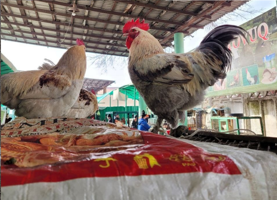
Friendly Chickens at the Yangibozor Market